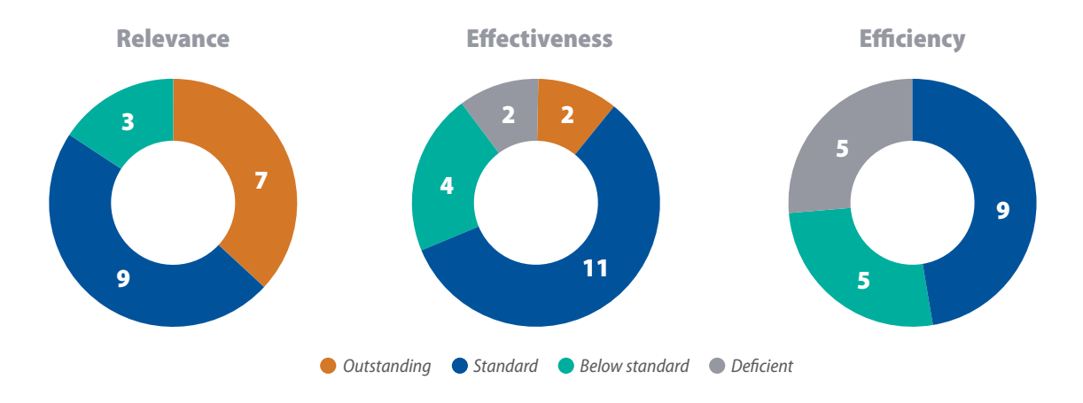
FIGURE 4. EVD CATEGORY PROJECT PERFORMANCE RATINGS 2018

projects cited lower than forecast revenues because of unforeseen market or regulatory changes.