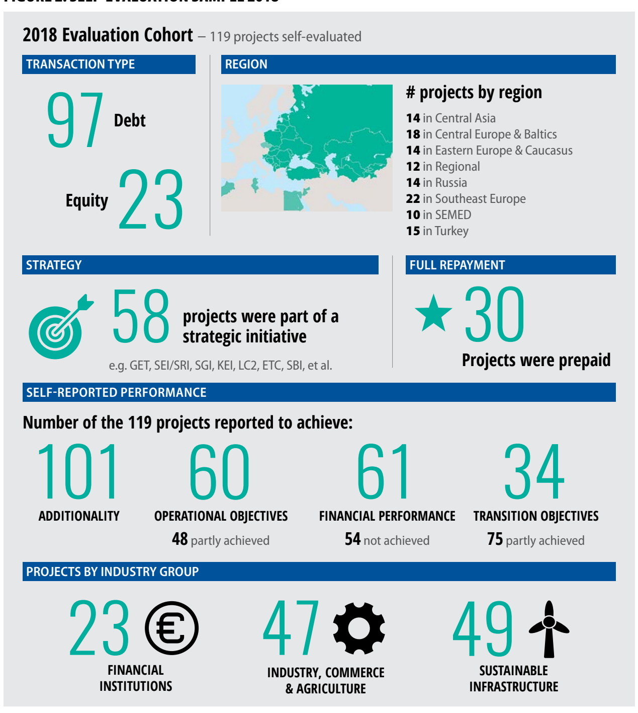
FIGURE 2. SELF-EVALUATION SAMPLE 2018

GET = Green Economy Transition; SEI = Sustainable Energy Investments; SRI = Sustainable Resource Initiative, SGI = Strategic Gender Initiative; KEI = Knowledge Economy Initiative; LC2 = Local Currency and Capital Markets Development; ETC = Early Transition Countries; SBI = Small Business Initiative.